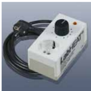
电源控制器 MiL-L116 Power controller MiL-L116