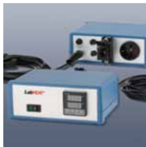
实验室调节器 MiL-RX 1000 Electronic laboratory regulator series MiL-RX1000