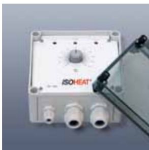
温度调节器 MiL-EC200 Electronic temperature regulator MiL-EC200

For temperature regulation we recommend our program of electronic control and temperature regulation appliances and corresponding temperature sensors.